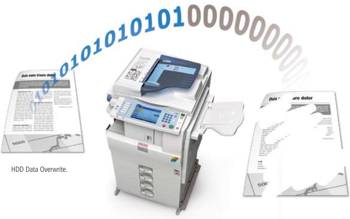
HDD Data Overwrite.

Authentication and encryption features protect your confidential data. The MP C2050 / MP C2550 are compatible with optional security packages like HDD Data Overwrite, Data Security for Copying, Card Authentication and Secure Print Release.